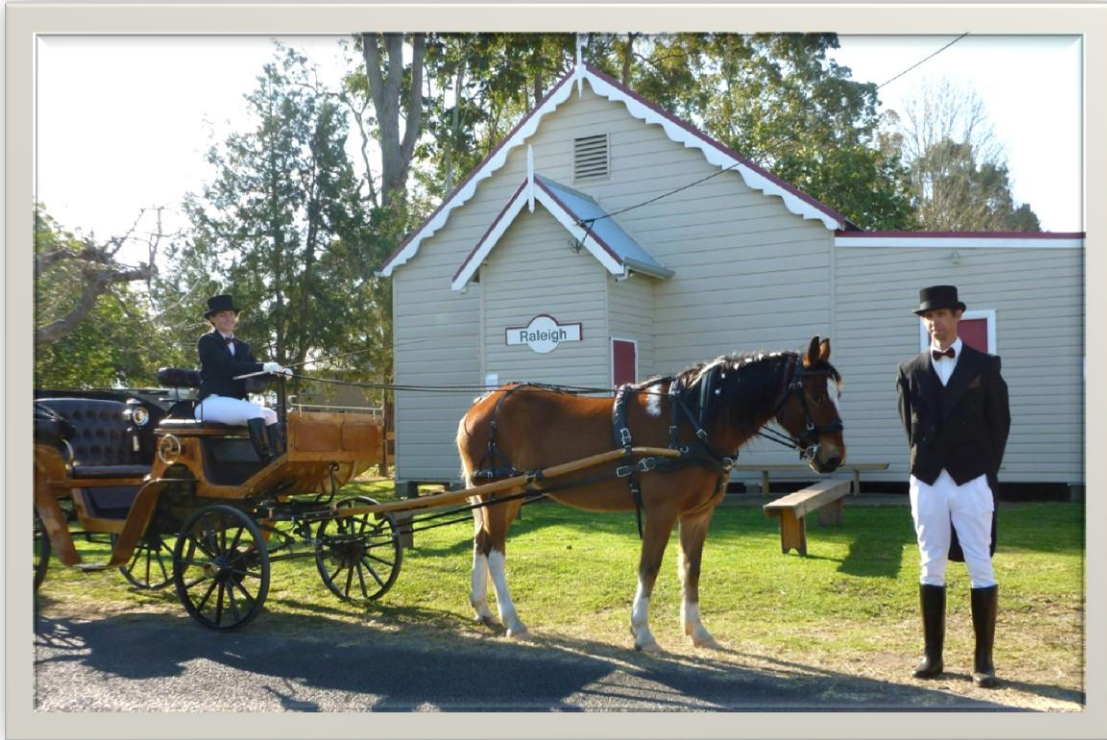
Contact Raleigh Hall Management Committee on 6655 4388 for your special event

The Community Building Partnership Program aims to enhance community facilities and increase activities and participation. The program will fund: