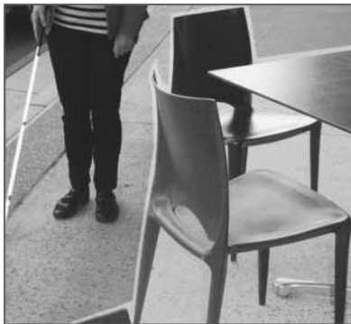
X FOOTPATH BLOCKED

Footpaths are community spaces and space needs to be kept clear for people to move along the footpath, especially for people with a disability that use mobility and vision aids. Providing clear and predictable access along the footpath and into buildings benefits everyone including older people, parents/carers with children and parents with prams. Council's Footpath Activities Policy aims to encourage footpath activities whilst keeping a generous walking path clear for people of all abilities to use.